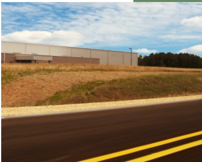
Looking north along the Fawn Grove Industrial Park Parkway

To download a complete demographics report about Itawamba County, visit the Itawamba County Development Council website at www.itawamba.com .