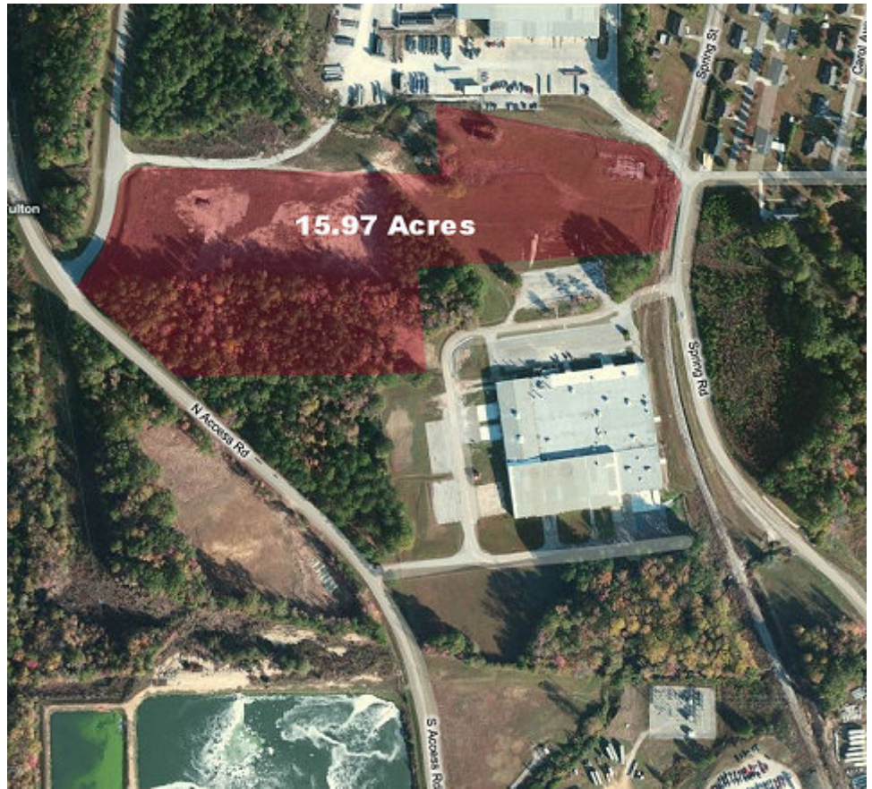
a view of a portion of the parcel

Port Itawamba Industrial Park is conveniently situated in northeastern Mississippi in close proximity to most all major southeastern cities and has a direct link to the Gulf of Mexico via the adjacent Tennessee-Tombigbee Waterway